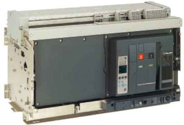
Masterpact NW 4000 to 6300 A