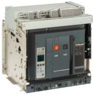
Masterpact NW 800 to 4000 A