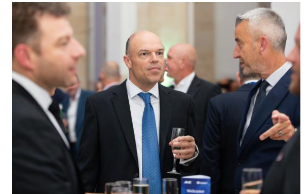
AUE Gala Dinner & Drinks Reception 2024